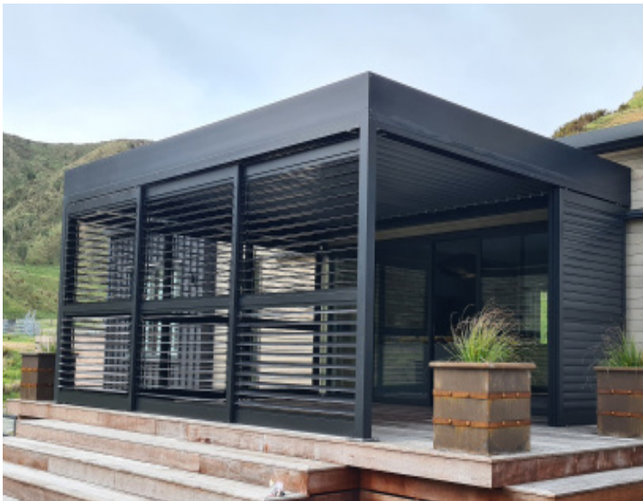
90MM SLIDING SHUTTERS USING KISS PIVOT DRIVE SYSTEM

Choose from two Airfoil and two Rectangular louvre blades.