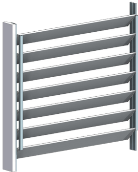
KISS PIVOT - 95MM BELLA VISTA RECTANGULAR LOUVRE PANEL